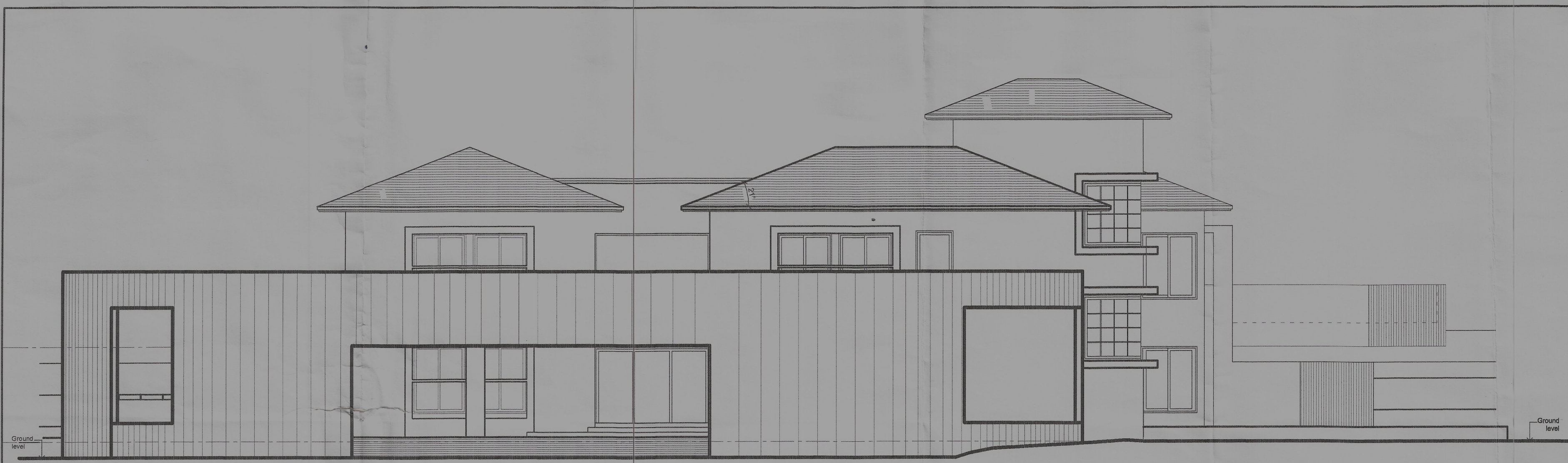
EAST SIDE ELEVATION